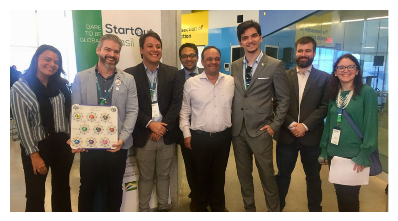
<u>Link to the Article: https://agenciabrasil.ebc.com.br/en/internacional/noticia/2019-06/innovative-startups-brazil-go-business-hunting-toronto</u>

Key2Enable is opening up a branch in Chile, as a result of the previous StartOut, in Santiago. The company has been active since 2009, and also has a subsidiary in the US, founded last year. Its flagship is a keyboard with 11 big, colorful buttons, with a distance from each other and sensitive to the touch. The sequence in which these buttons are pressed is equivalent to pressing a key on a regular keyboard, which enables people with disabilities to communicate more efficiently, without accidentally touching the keys. For those who can only move their eyes, communication is made possible by the connection between the keyboard and a blink detector, which can be attached to any pair of glasses.